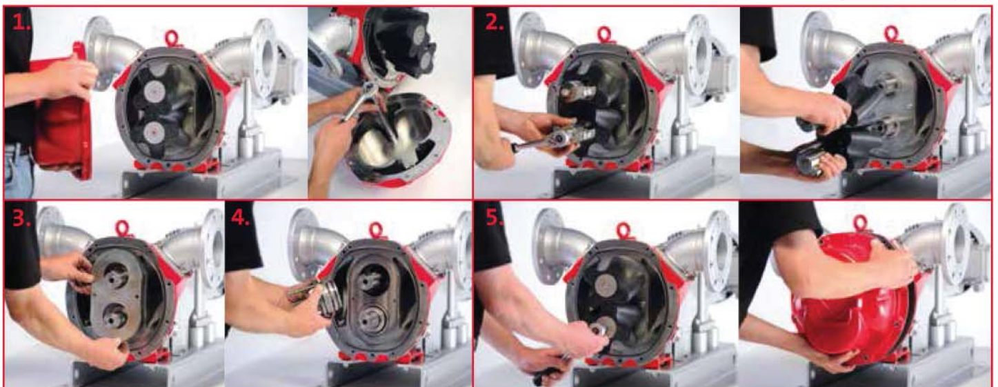
Example of lobe change in an IQ series pump

For all pumps in the VX and IQ series we can safely say: complex and time-consuming servicing is now a thing of the past.