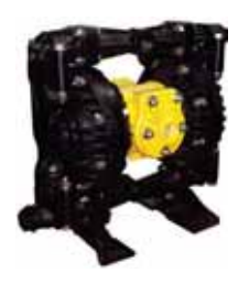
Ebony Series Noryl Body- Corrosive Resistant Internals- For Acids And Other Hazardous Liquids.