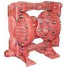
Red Series FRASplas Body- Fire Retardant Antistatic Construction - Safe for Explosive Environments Atex M1 Rating