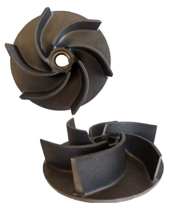
HOMA AVX technology is an excellent solution for the growing challenge of today's waste water streams.