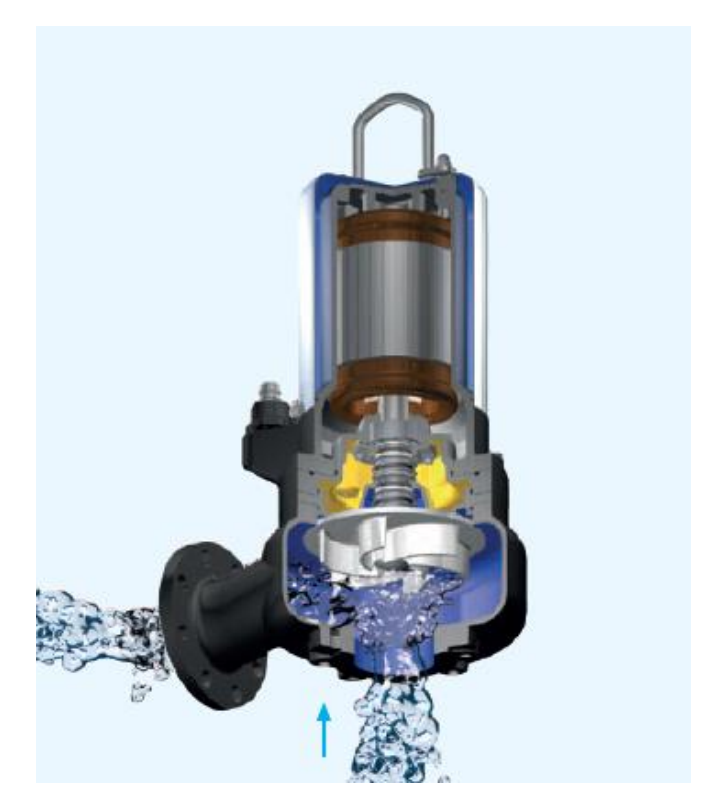
With the optimized Vortex flow path, clogging is prevented and wear is minimized.

Innovative impeller design is provided in cast iron as standard. Hardened iron or rubber coated options also available.